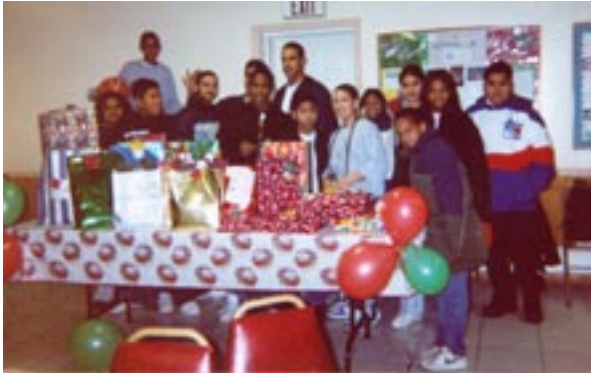
HIC Youth Program members happy with their Christmas gifts.

tation, Cholesterol Test, Eye Screening and HIV Testing. In a joint effort with AMERIGROUP of NJ, the Center helps our clients with New Jersey Kid Care referrals and flu shots for our senior clients. A total of 697 were served.