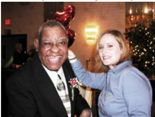
Resident ready to "cut the rug" with a staff member at the Murray House Dinner Dance.

The Department for Persons with Disabilities' (DPD) philosophy is that all individuals are truly God's gifts. Our foundation is that all human life is sacred. Maintaining the highest standards to provide the maximum quality of life possible for people with mental retardation and other developmental disabilities, is at the apex of the DPD's goals and objectives.