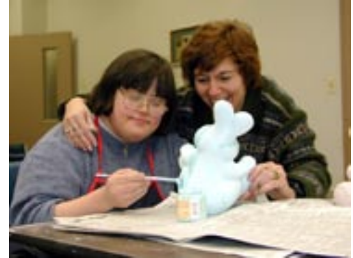
DPD staff member assisting a client at the Gruenert Center with a ceramics project.

The COA compared the DPD according to national "best practice" standards for not-for-profit management and developmental disabilities programs. These are the highest standards in the field. The DPD has been continually accredited since 1986.