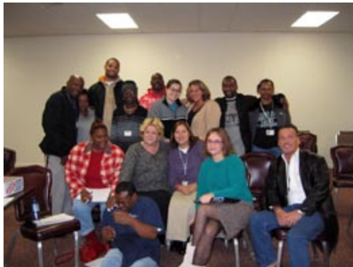
Straight & Narrow staff gather for a group photo after completing the agency's annual training.