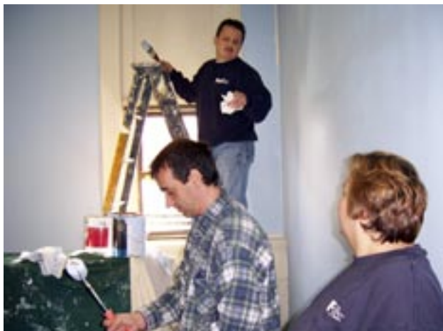
Volunteers paint a senior's home for the CHORE program.

Home Sharing: Home Sharing is a creative alternative in Morris County focusing on establishing home share relationships. Individuals who wish to share