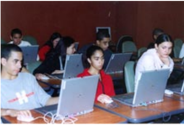
FECC teenage computer training program

and quality childcare to 46 multi-ethnic children from primarily low-income families in Paterson and Passaic County. The program evolved in response to the needs of the working parents in our pre-school programs who are working part/full time, or are enrolled in school/training programs and so their children are eligible for priority placement at the kindergarten, which runs from 7:00 AM until 5:00 PM year round. This program is vital to working parents who need full day childcare.