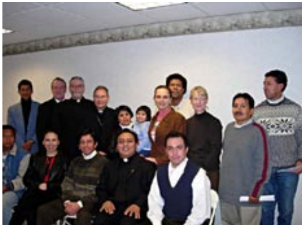
Migrant Ministry team and clients

information on stroke detection and osteoporosis. We also developed The Hot Line 1(877)724-5112 for the area of Newton and Sparta, with information on transportation, clothing, furniture, ESL, Mass schedules. The most important use of the Hot Line is for requesting medical appointments or medical needs. This year 7 volunteers spent 560 hours attending the Hot Line. About 261 people were served; 143 received dental or medical appointments. There were an additional 1,040 hours in transporting our clients and doing follow-up appointments.