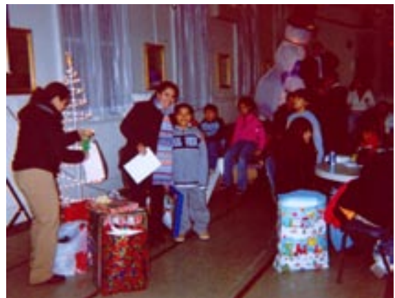
Members of the HIC Youth Program at the annual Christmas party.

Domestic Violence: The Center continues its affiliation with the Passaic County Women's Center. Persons with domestic violence situations can call or visit the counselor three days a week – Monday and Tuesday from 9:00 am – 5:00 pm and Thursday 2:00