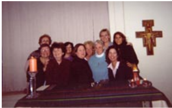
Congregational Health Ministry Health Parish Nursing Course graduates 2005

for 32 contact hours, the "Parish Nursing, A Basic Preparation Course" is the only course of its kind offered in New Jersey and continues to be well attended. To date, over 207 participants have completed the certification course. This course also provides a vehicle for nurses to come together for continuing education programs throughout the year. In January of 2004, St. Joseph's Wayne Hospital hosted a parish nursing continuing education program on End of Life Care, called Bridging the Gap. Clinicians from Passaic Valley Hospice, Totowa, and St. Joseph's Regional Medical Center, Paterson, as well as a local funeral director shared their expertise with parish nurses and others who work with parishioners at the end of their lives. In March 2004, 67 participants attended "Integrating Spiritual Care in Health Ministry