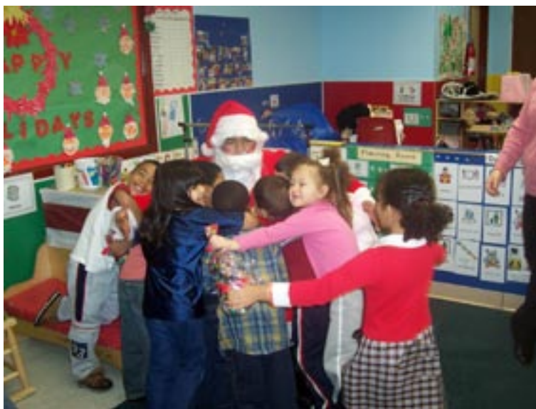
Children at La Vida Child Care Center rush to get in on a group hug with Santa Claus.