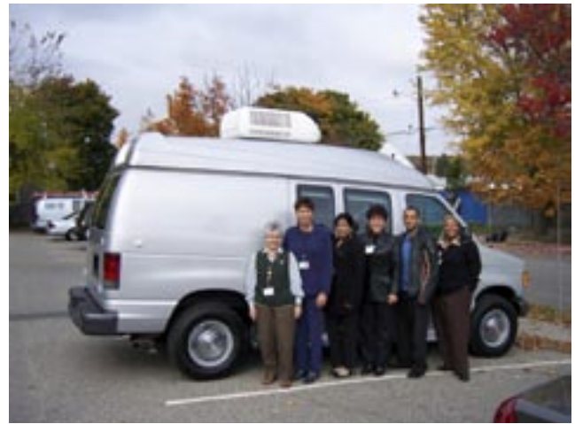
New HIV/AIDS mobile counseling and testing van.

The AIDS Center: Comprehensive services include a Mobile Testing and Counseling van, case management, mental health therapy, substance abuse counseling, housing assistance, support groups, transportation, emergency food pantry, and the development of integrated service delivery plans by our bilingual staff. In 2004, centralized AIDS specific services