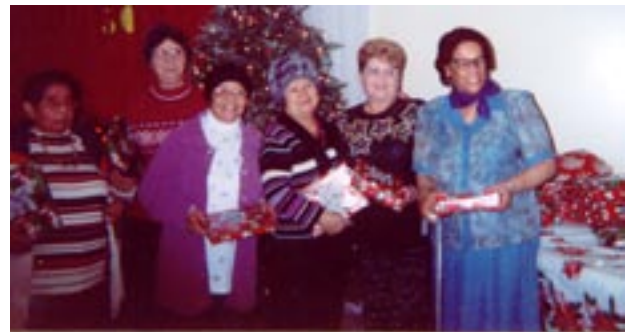
HIC Seniors Program Members enjoying their Christmas lunch & gifts.

The Center provides services to low to moderate income families with a variety of resources which provide hope and encouragement toward self-sufficiency. In order to assist people to cope with daily hardships, the Center operates a series of programs through which the Agency becomes an oasis for the lonely senior, the jobless, the troubled teenager, the abused child, the abused spouse, the addicted, those threatened by eviction from their homes and the homeless. Our open door policy allows people to