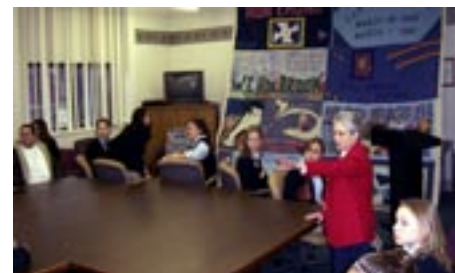
Presentation at Hope House to a group of Morris Catholic High School students on World AIDS Day 2004.

Behavioral Health Services: BHS provides both mental health and substance abuse counseling offering comprehensive adult, family and adolescent therapeutic services; women's and men's anger management groups (the men's group is facilitated in Spanish); prevention programs; substance abuse evaluations and counseling; IDRC/EDG programs; parenting education classes