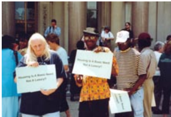
Parish Social Ministry program and supporters in Trenton making their views known.

The mantra of the PSM office is the "two feet of social justice", which are service and advocacy. There was a significant legislative advocacy gathering in Trenton this past May. The Catholic Coalition for a Just Budget organized a rally on the steps of the State Capitol for the purpose of advocating for the needs of the poor as related to the inadequate funding of social service programs by the State. A bus load of Catholic advocates from around the Diocese gathered at St. Philip's Church in Clifton to travel to Trenton for the rally. Legislators seemed to hear our message as our concerns were eventually borne out in Governor McGreevey's State Budget priorities. Greater emphasis was placed on services and funding for the poor. The national Catholic Social Justice Gathering was held in February in Washington, D.C. Catholics from our Diocese and Dioceses around the country visited "Capitol Hill" to speak with our Senators and Congressman concerning issues affecting the poor in the United States and around the world. Planning is beginning now for a very important "Legislative Advocacy Evening" to be held in 2006. Our State legislators, covering the Districts within our Diocese, will