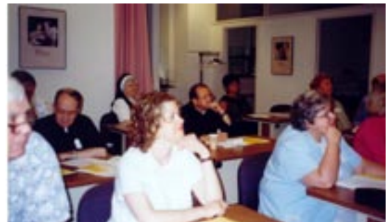
Disaster Preparedness Seminar August 2004 held at the College of St. Elizabeth

Each parish creates a ministry that is unique to its needs and resources. Overall, the presence of a health ministry builds community while bridging the gap between professional health care providers and local community resources. Recipients of these services often relate that the most important benefit is