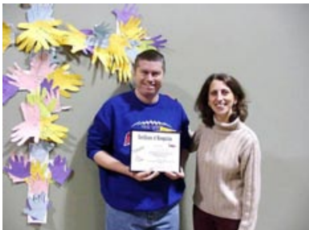
DPD resident receiving the Catholic Adult Religious Education (C.A.R.E.) Award of the month.

Our residential programs include nine group homes: Alexander House, Columbus House and Finnegan House in Oak Ridge; Wehrlen House in West Milford; Fitzpatrick House in Pompton Lakes; Wayne House