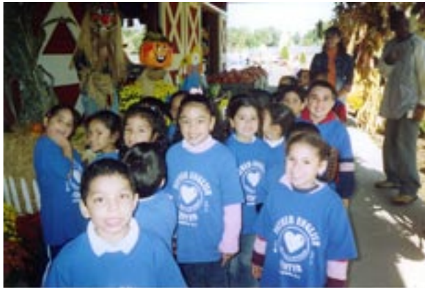
Father English Center kindergarten children on their annual field trip.