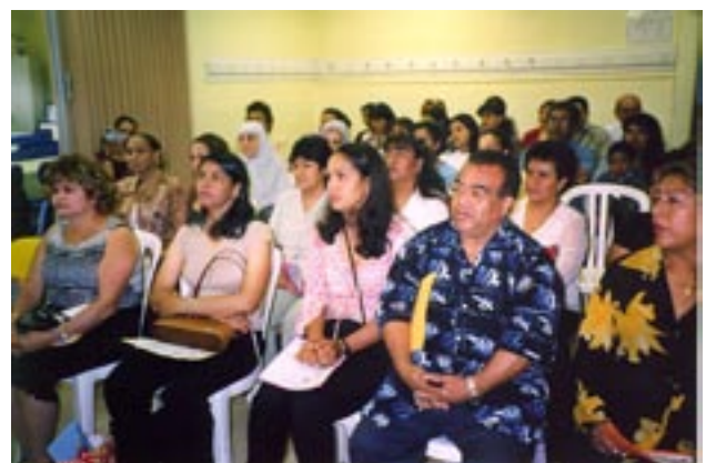
Father English Center Parents Teaching Parents English class

A world of colors is funded through the Department of Education and the Department of Human Services.