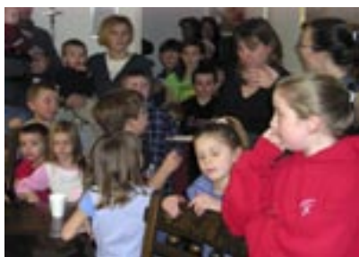
Clients of Paternership for Social Services Family Center in Franklin gather for the annual Christmas party.

health services. Services include individual and family therapy, and play therapy for children. Support groups and educational seminars are also provided throughout the year.