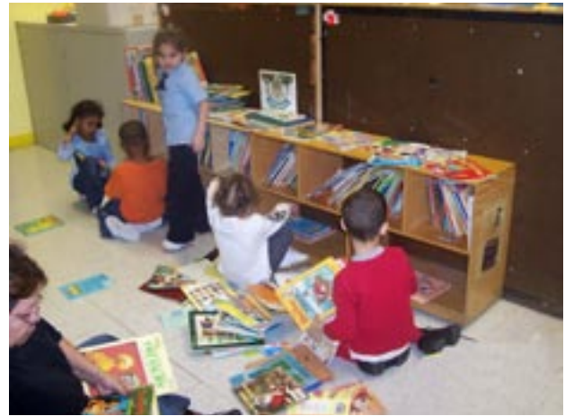
Children at La Vida Child Care Center helped to organize some of the many donated books received by the agency this year.