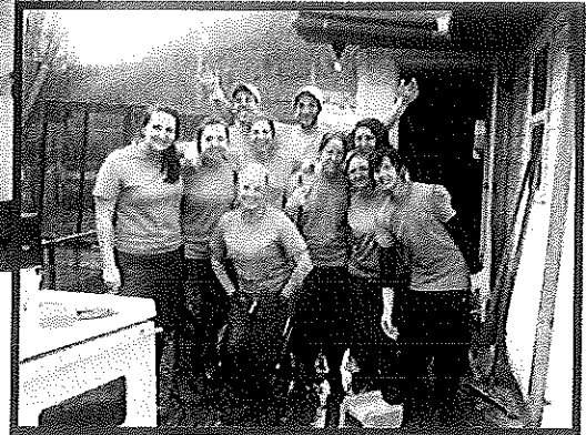
Pictured are team members from Canisius College, New York - March 2012